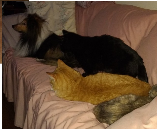
Hey Mom, I got all three of the cats ready for a nap...can have a treat?