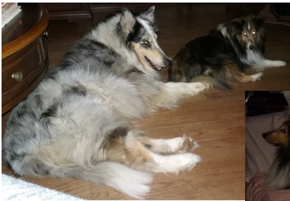
Skyla is a big girl that likes to protect me awake and a sleep as if I am her pup!