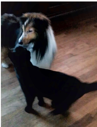
Hey, it's me, Louie...Oh now you want a kiss!