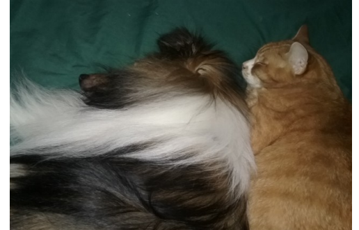
Thor, the cat, likes to cuddle and so do I.