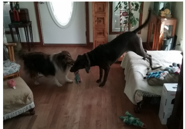
Another day and another game of Tug of War with Gabbee! She likes the window seat, but I always win because I am so strong!