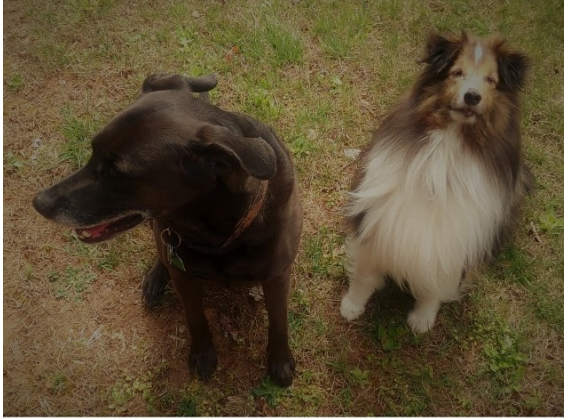
Hey Mom...cookie time!! Open the cool carrots now!!!