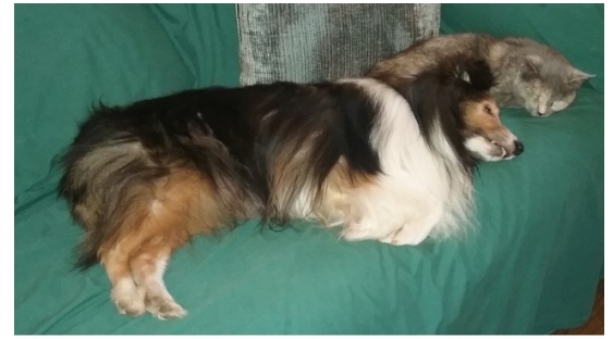
I comfort Madison, the 22 year old cat, when she needs me to. She sleeps all the time now and I don't mind.