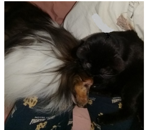
My time on Dad's lap with Trouble, the 17 year old black cat! He likes to clean my ears and eyes and I don't mind because he thinks I am his big kitten!