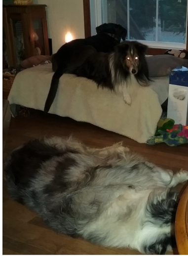
Resting on our window seat waiting for Dad and Skylia is taking a nap!