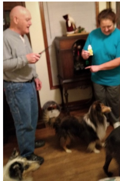
Give me my presents before Dad lights the candle again!