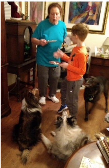
Goody, goody, goody, here comes my birthday cookie with yogurt! I know that I am special because I get the first plate!