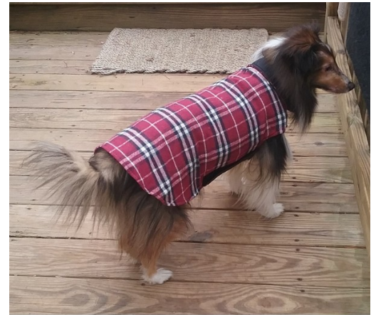
My new jacket fits me just right!! My Mom knew just what to get me for my 8th birthday!