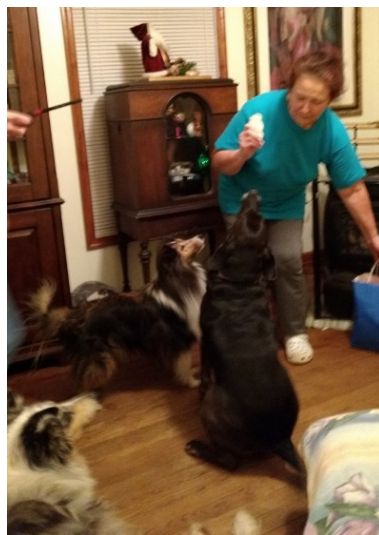
Oh boy!! My 8th birthday party with my new friends and family. Hurry Mom and blow out the candle!!