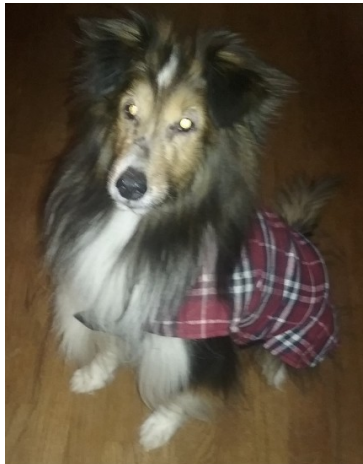
Look at how dashing I am in my new birthday gift. Mom said the red boldly brings out the color of my fur!