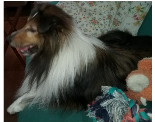
Oh goodness I am tired and so is my orange Ellie and my rope! Time to rest a bit.