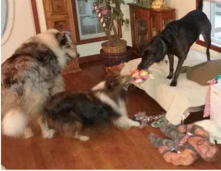
Yay! one of our tug of war games! We decided to use one of my Elies, but Skylia is checking out the situation to make sure we are just playing!