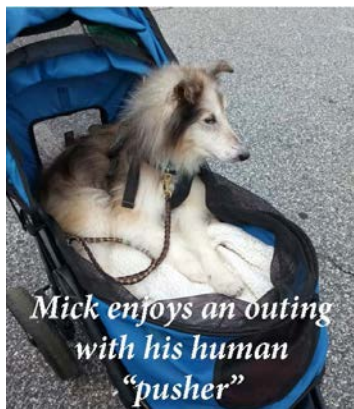
Mick enjoys an outing with his human "pusher"

The shelter coordinator warned us the dogs had so many health problems that they might not survive until the suit was settled. Nearly nine months after they were brought to the shelter, NVSR finally picked up the three Shelties and placed them in our foster homes. Their health issues were horrific.