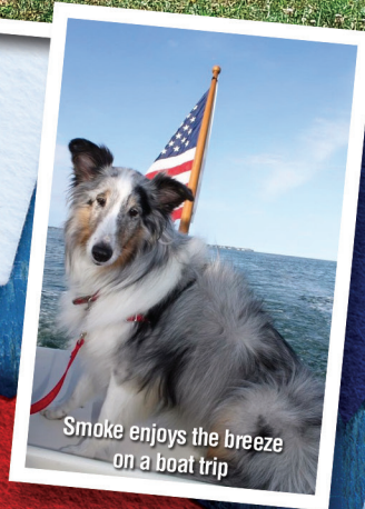
Smoke enjoys the breeze on a boat trip