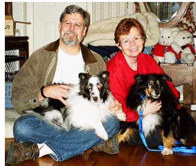
Frosty & Tux (2006)