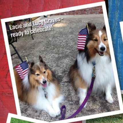
Lacie and Lucy Graves - ready to celebrate!