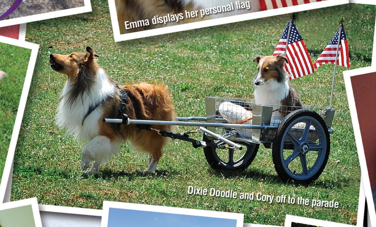
Dixie Doodle and Cory off to the parade