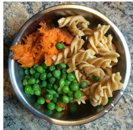
A sample meal - Looks delicious!