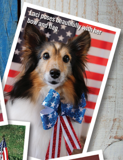
Laci poses beautifully with her bow and flag