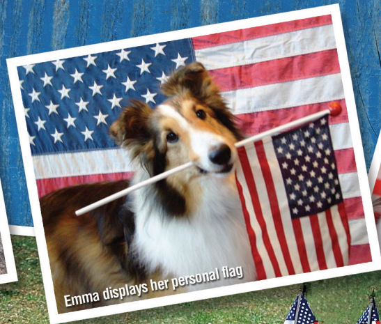
Emma displays her personal flag