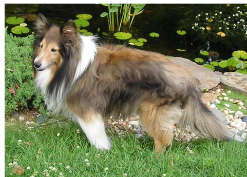
Lionheart when he came into Rescue and Lionheart after his coat grew out.