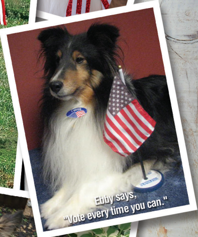
Ebbly says, "Vote every time you can."