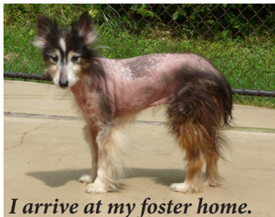
I arrive at my foster home.

I don't know how I ended up on the streets, starving, parasites inside and out, and in terrible pain. My mouth was so sore I snapped at anyone who touched my head. My nearly naked body was getting