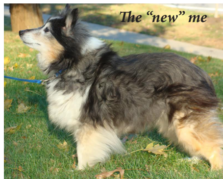
The “new” me

Foula is “Miss August”, napping in a sunbeam on our 2018 calendar. Check it out in the website Sheltie Shop!