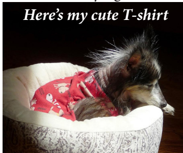
Here's my cute T-shirt

to Foster Mom, who to my great surprise understood what I was saying! She must have been raised by wolves because she used the signals I learned as a pup! I